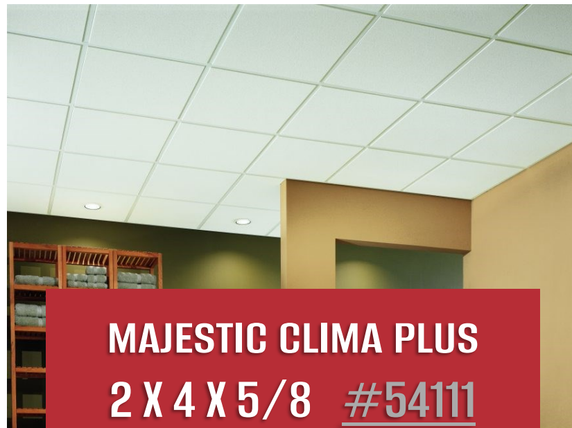
MAJESTIC CLIMA PLUS 2 X 4 X 5/8 #54111