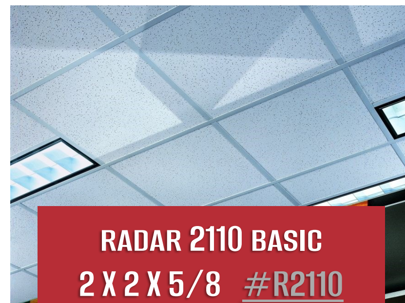
RADAR 2110 BASIC 2 X 2 X 5/8 #R2110