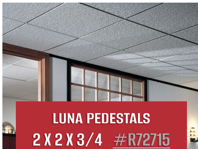
LUNA PEDESTALS 2 X 2 X 3/4 #R72715