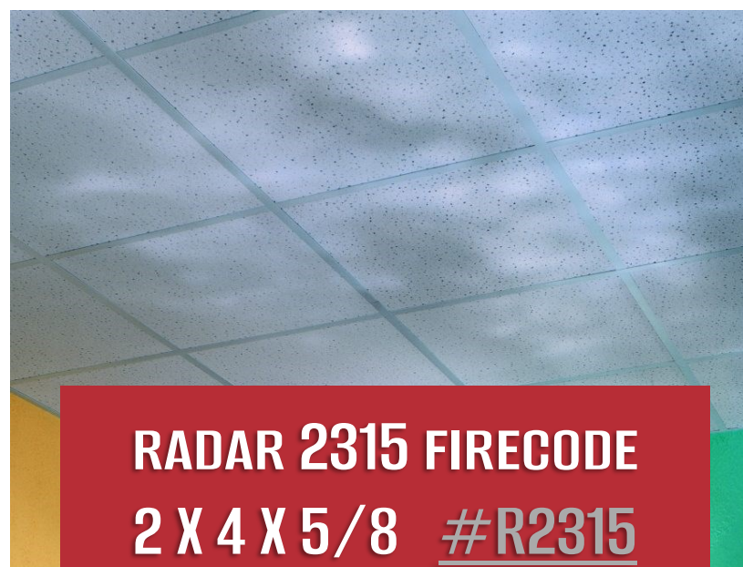
RADAR 2315 FIRECODE 2 X 4 X 5/8 #R2315