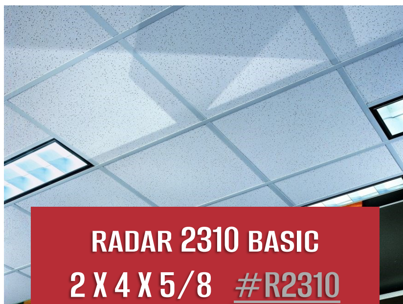
RADAR 2310 BASIC 2 X 4 X 5/8 #R2310