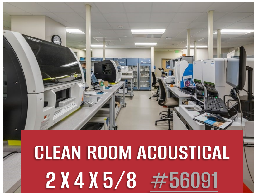
CLEAN ROOM ACOUSTICAL 2 X 4 X 5/8 #56091