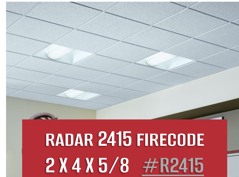
RADAR 2415 FIRECODE 2 X 4 X 5/8 #R2415