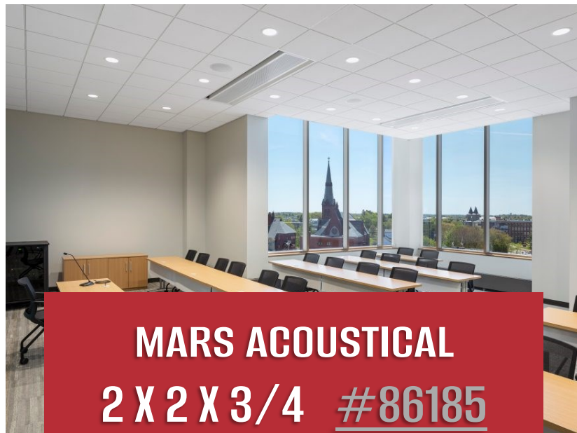
MARS ACOUSTICAL 2 X 2 X 3/4 #86185

Click on desired # to visit the CGC web page